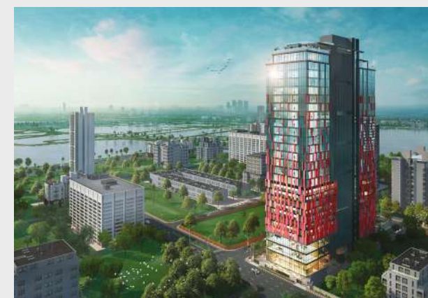
The Summit | Sector V, Kolkata