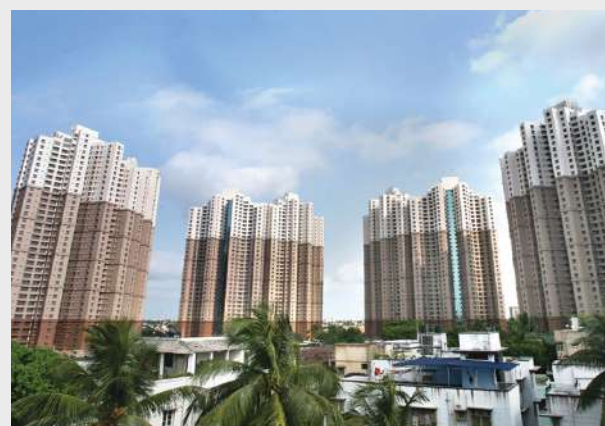
South City Residence | Kolkata