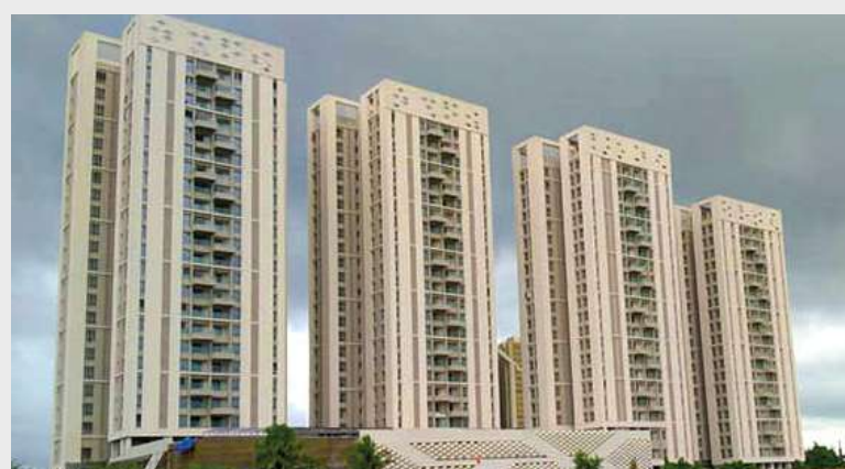
Fifth Avenue | Sector V, Kolkata