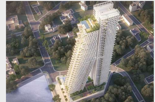
Altair | Colombo, Sri Lanka