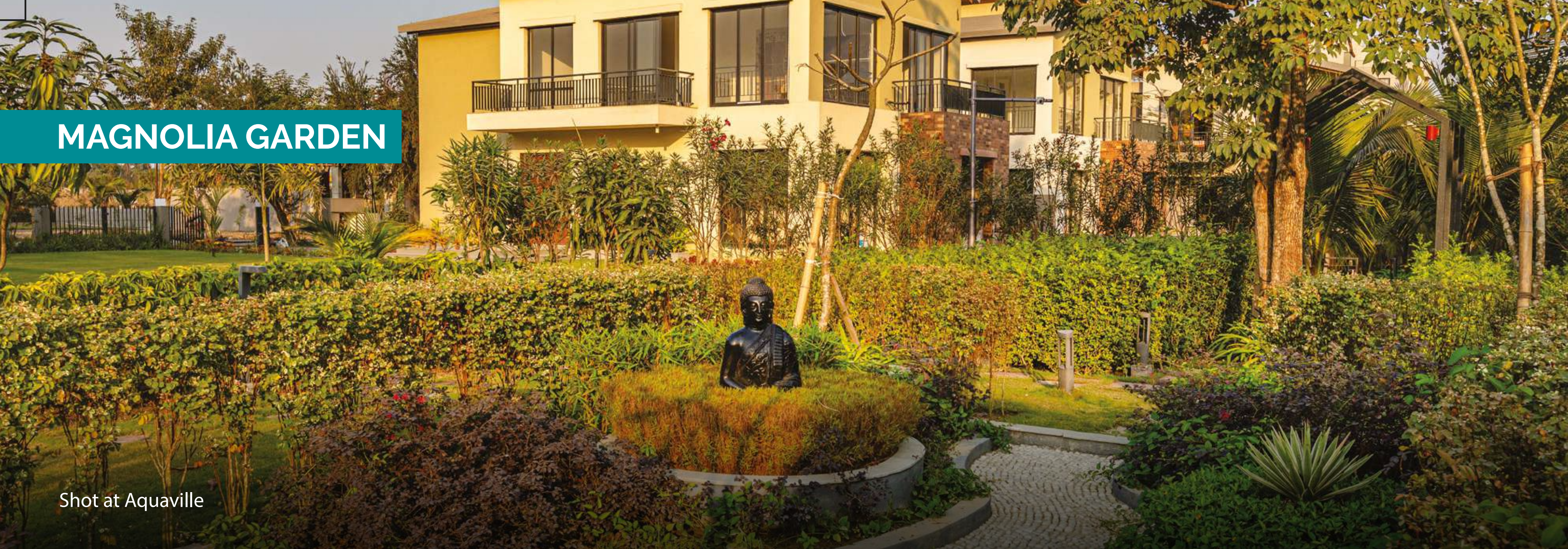
Shot at Aquaville