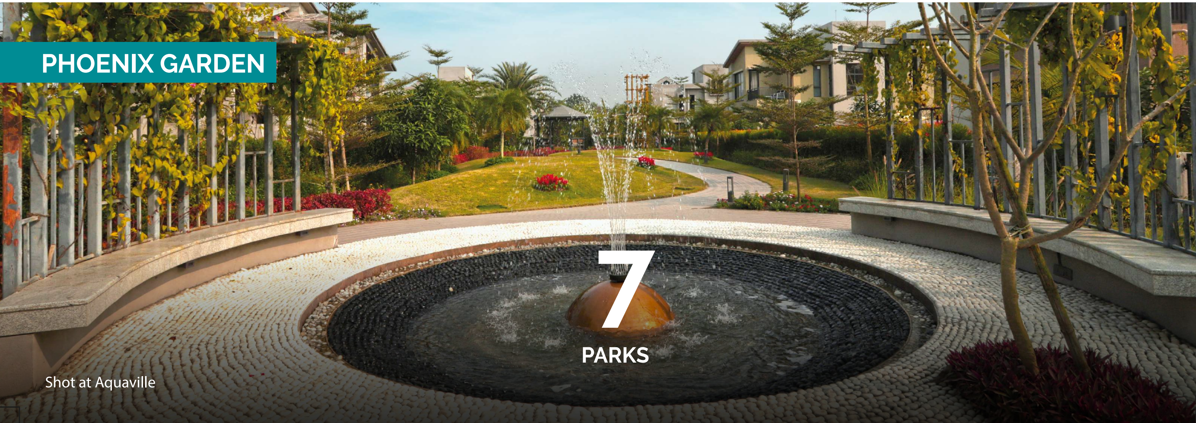
Shot at Aquaville