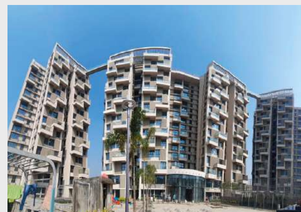
The One | Tollygunge, Kolkata