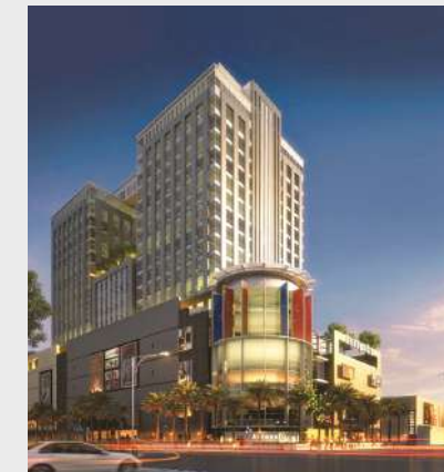
Acropolis Mall | Kolkata